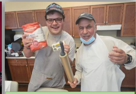
Connors Culinary Creations homemade biscuits. Yum!