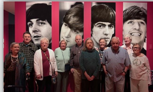
Paul McCartney photo exhibit at the Chrysler Museum.